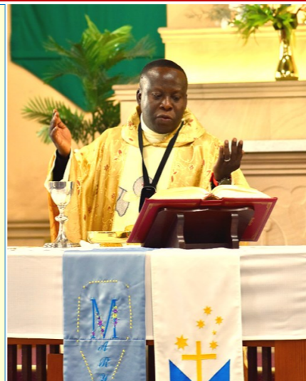
ST MARY'S CATHOLIC CHURCH